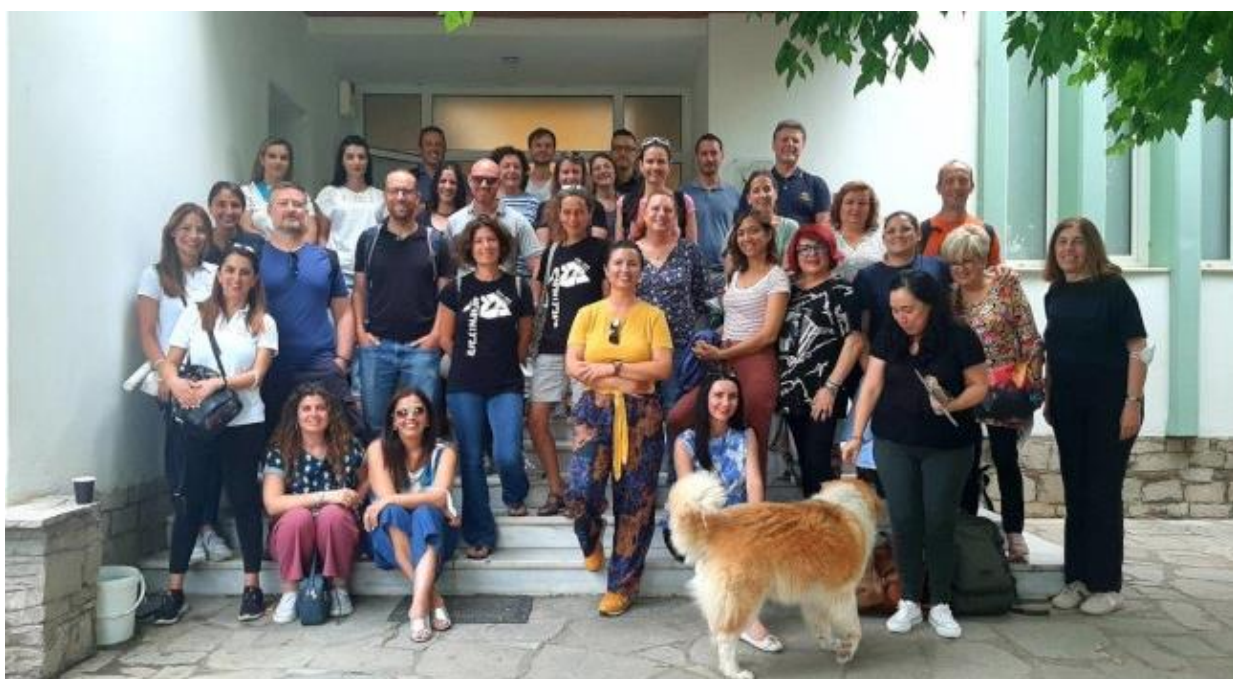
TUNE UP partnership

stakeholders and decision makers, limiting raising conflicts between preservation and economic issues, and will enhance the goal of biodiversity protection. Thus, the project achieved the following results: (i) stronger, coordinated and proactive involvement of key stakeholders in MPAs management; (ii) improved effectiveness of MPAs management by integrating multilevel governance tools into national and regional policy instruments; (iii) more intensive transnational cooperation and networking between Med MPAs. The partnership involved different types of actors operating in MPAs management, thus allowing TUNE UP to ensure high transferability of main outputs to Med Countries.