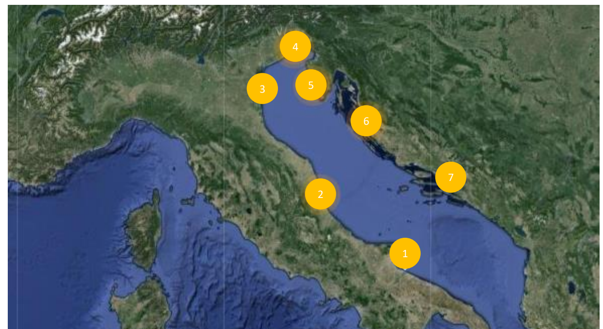
Pilot areas: 1) Ofanto River, 2) Sentina Nature Reserve, 3) Venezia Lagoon, 4) Marano Lagoon, 5) Palud Palù, 6) Malo i Veliko Blato, 7) Neretva River Delta