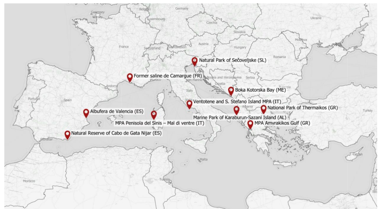
TUNE UP pilot areas