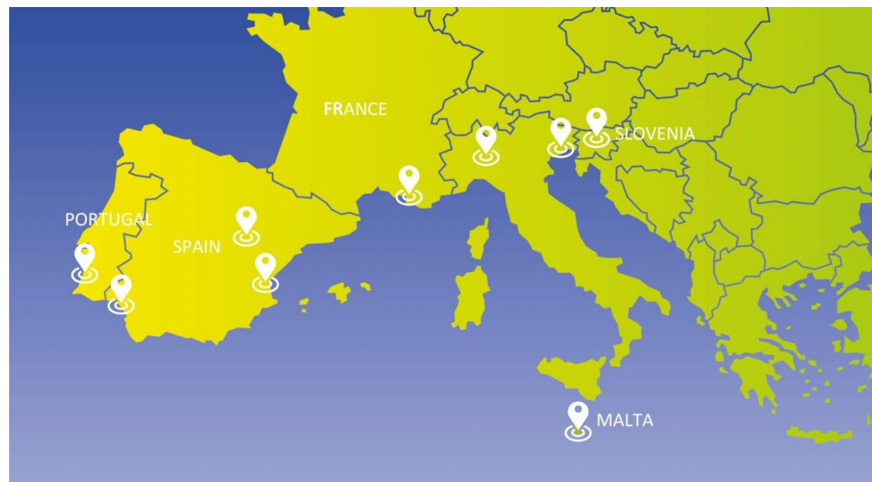
WETNET Pilot areas