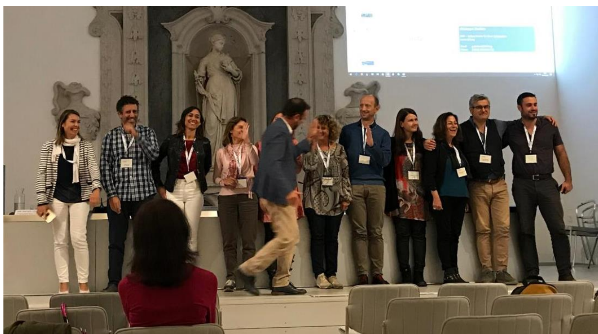
WETNET Partnership during the Final Conference

designations to be adapted to the local contexts and regulations in each of the participant countries, being defined as an agreement between public and private parties, implying real commitment by the signatories. Nine Wetland Contracts were outlined and subscribed by the local stakeholders, based on governance Action Plans, encompassing a total of 67,061 hectares of protected areas: Italy – Caorle Lagoon (Veneto) and Vercelli Lowplain (Piedmont); Slovenia – Ljubljansko barje Nature Park (Central Slovenia); Spain – Odiel Marshes (Huelva), Albufera de Valencia (Comunitat Valenciana) and Cañizar Lagoon (Aragon); France – Verdier Marshes (Rhône Delta); Portugal – Melides Lagoon (Alentejo); Malta – Gozo Island.