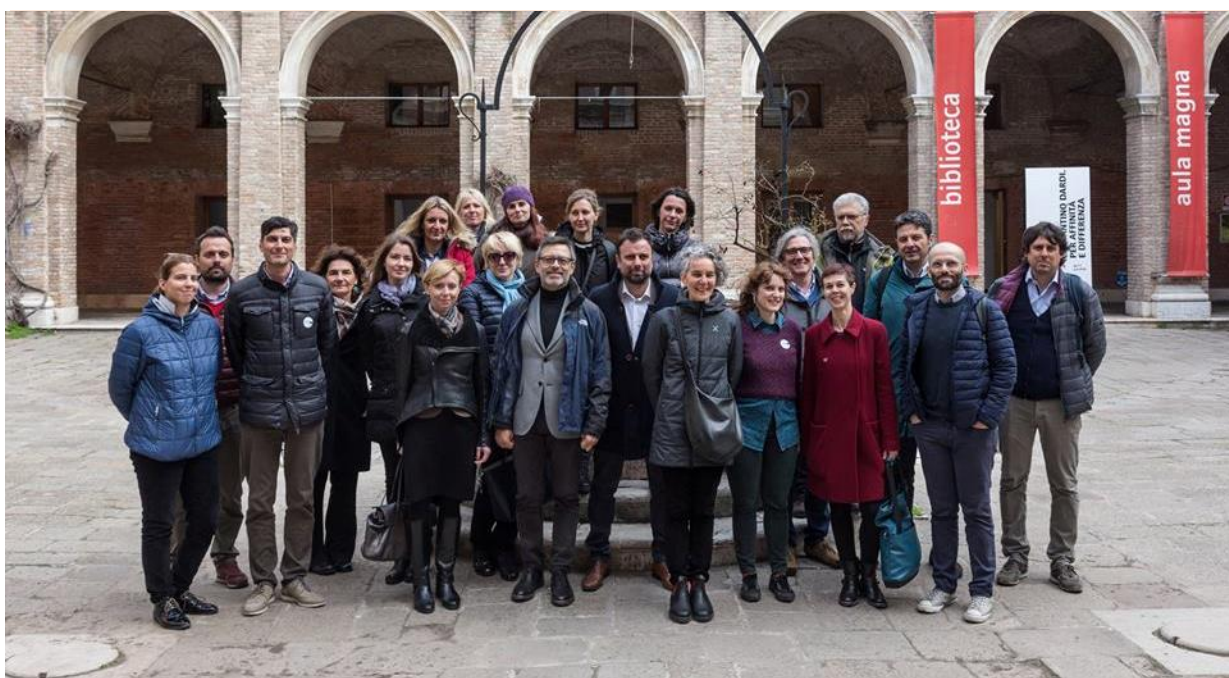
Interreg IT-HR Partnership

mouth of the Ofanto river, the natural reserve of Sentina, the north lagoon of Venice, the lagoon of Marano, the ornithological reserve Palud, the island of Pag and the mouth of the Neretva river. It assured higher coordination among stakeholders and decision makers, limiting and absorbing raising conflicts between preservation issues and economic activities (farming, aquaculture, tourism) and enhanced the achievement of sustainable long-term results. The awareness of the wetland ecosystems value among policy makers, managers, professionals, and general public was raised while their active engagement in territorial governance was strengthened.