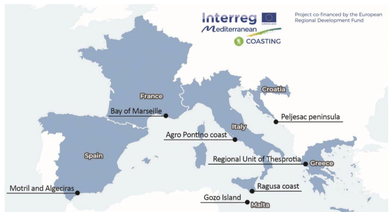
COASTING pilot areas