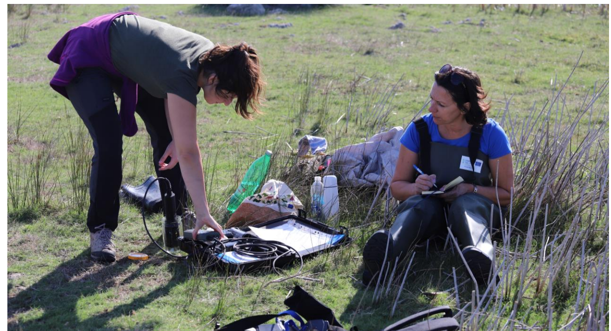
Research and monitoring