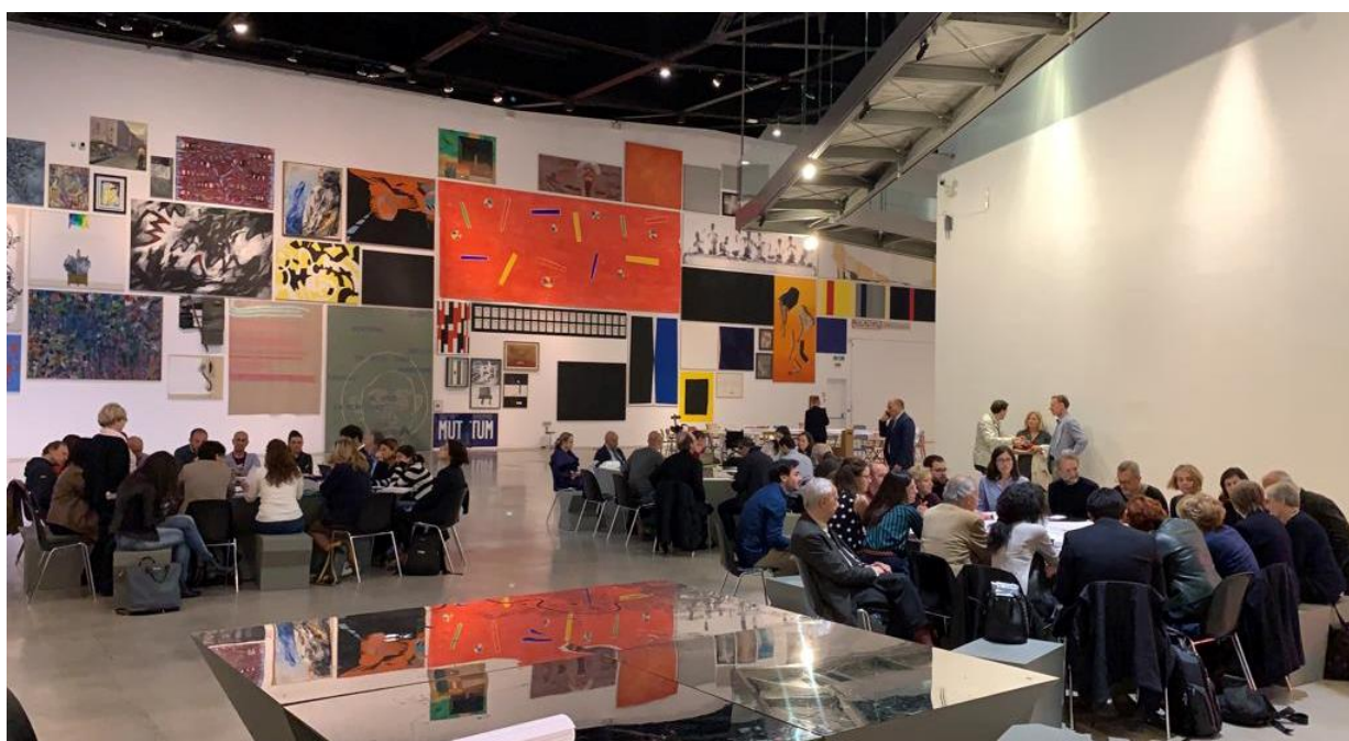
Workshop «Towards the first three-year Action Program of the Tiber River Contract»

a Strategic Document was defined and signed. The process continued with the engagement of stakeholders in the construction of the first three-year Action Program, supported by regional funding. On February 22, 2022, the Negotiated Programming Agreement was signed by 86 stakeholders (55 associations, 18 public institutions, 7 research centers and universities, and 6 private sector entities). The Action Program consists of 39 actions promoted by 30 signatories of the Agreement, with an overall value of approximately 80 million Euros. The signing of the agreement also marked the formal assignment of the Metropolitan City of Rome Capital as the coordinating entity, in cooperation with Agenda Tevere Onlus.