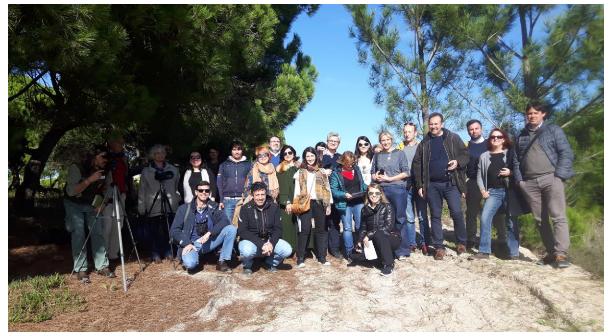
Study Visit to Melides Lagoon