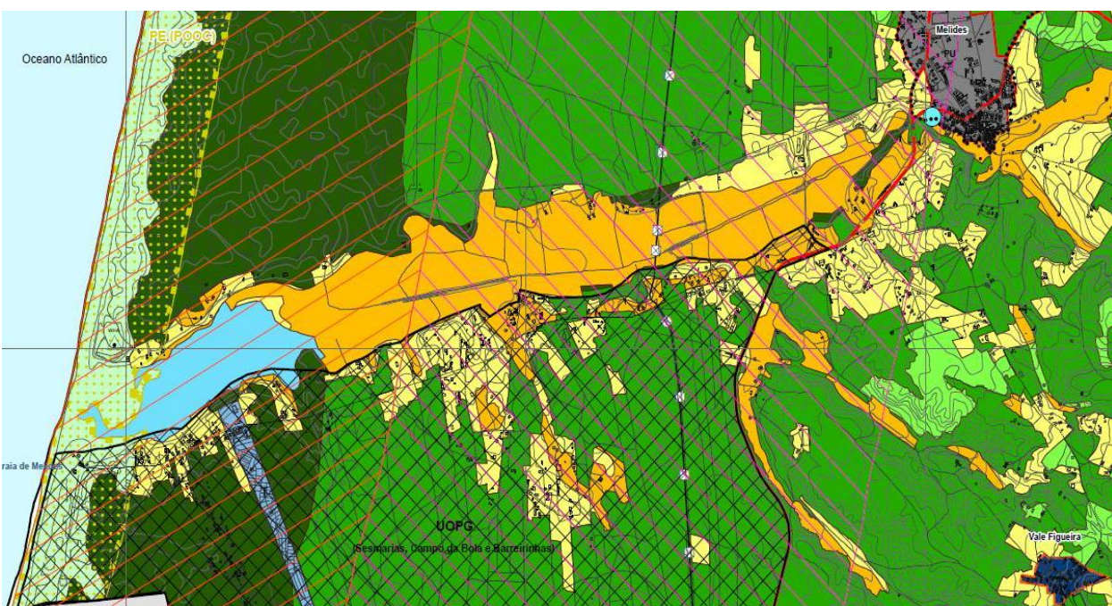
Land-use planning in Melides Lagoon

the success of the process: i) Adoption of a mixed approach based on general, sectoral and individual meetings; ii) Keeping a frequent presence in the area and showing results along the process; iii) Inviting “neutral” experts to present the technical vision on the most controversial issues. The stakeholders agreed on an Action Plan that allocates responsibilities for the achievement of 18 measures covering environmental protection, economic development and governance. A Wetland Contract under the form of an Environmental Agreement for the implementation of the Action Plan was subscribed on June 2019 by 17 stakeholders and is being implemented.