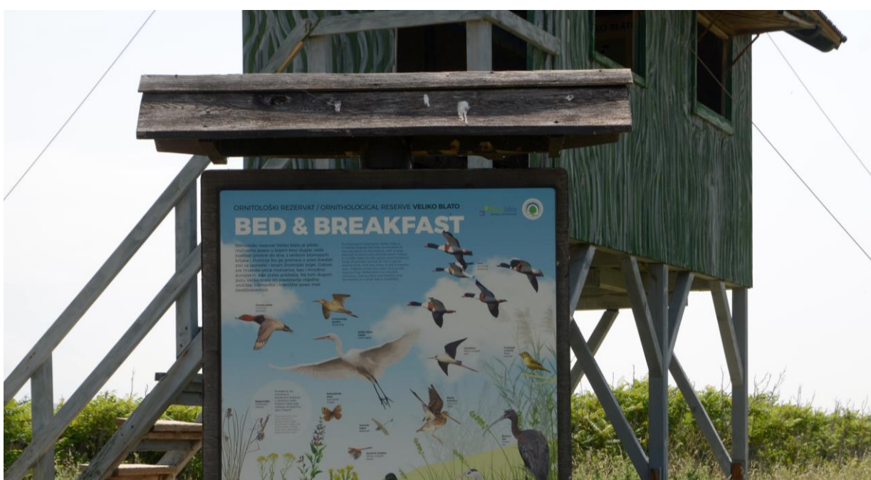
Promotion of the birdwatching activities

Action Plan. It promotes the sustainable development and protection of the site by improving the visibility of the area as an ornithological reserve and Natura 2000 habitat, strengthening cooperation and networking among the stakeholders, stimulating tourism development without jeopardizing the site's values by investing in the patrolling and monitoring equipment and promoting birdwatching activities, encouraging the active participation of the broader public, reducing poaching in the area, and fostering intersectoral dialogue between the competent institutions. The target area directly benefited from the cooperative approach, resulting in a better conservation status of the natural ecosystems.