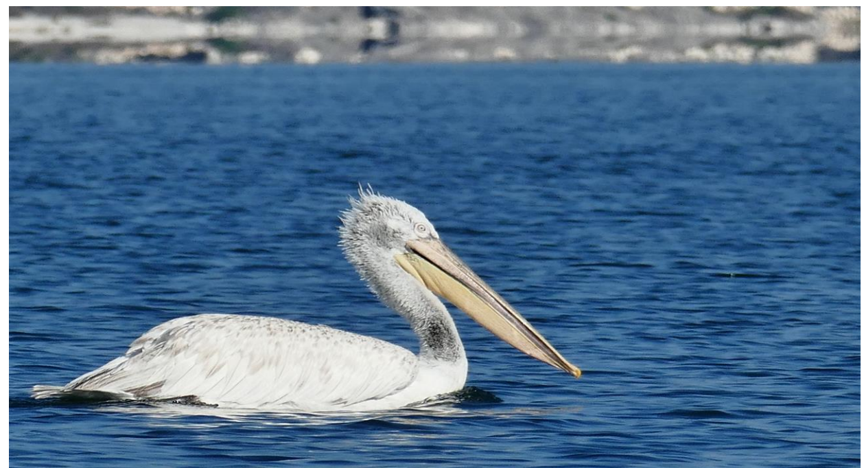
Dalmatian pelican ( Pelecanus crispus ). Prespa National Park, Albania. (2021)