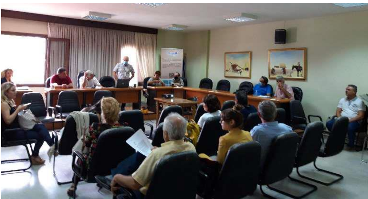
First Local Conference at the Municipality of Delta City Hall

labs held during the project's implementation. The main outcome of this effort was the establishment of communication and interaction among public bodies, users, and organizations active in the area, addressing critical issues of the Axios Delta MPA. Specific problems by sector were identified, and concrete actions were proposed to resolve them, balancing local development with environmental protection. Finally, through the signing of a Memorandum of Understanding (MoU), stakeholders agreed to collaborate and form a local contract for the Axios Delta MPA, complete with a specific action plan and timeline.