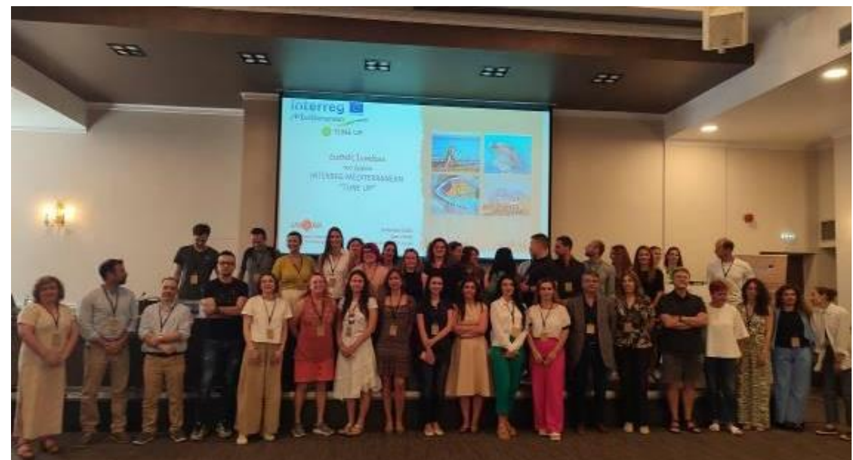
Final Conference of the TUNE UP Project