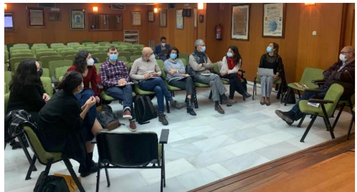
Representatives of all the Andalusian Natural Parks, governance meeting