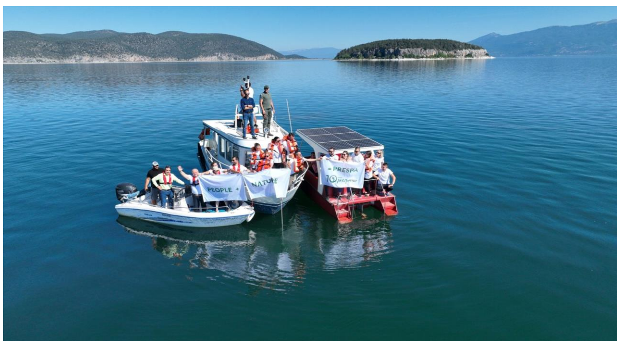
Celebrating a decade of PrespaNet of transboundary (2023)

education and Prespa Field Laboratory, with its transboundary annual summer schools, iii) species monitoring and ecological corridors protection, as well as iv) transboundary cooperation. The establishment of local offices on all three sides of the basin (Albania, Greece, and North Macedonia) was a milestone achievement for the network, securing closer cooperation amongst the three NGOs and creating a collaborative ground with local communities. Recognizing the importance of strengthening civil society participation in the transboundary governance of Prespa Park, PPNEA and its PrespaNet partners participate in the Prespa Park Management Committee, advocating for nature conservation policies.