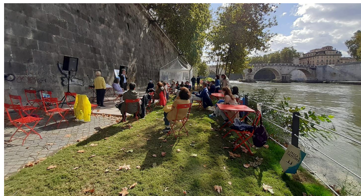
Participatory event «River dialogues, the territory encounters Institutions»