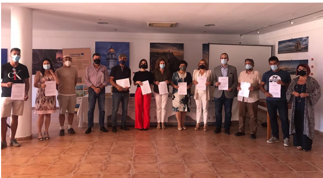
Signing of the MoU and the Action Plan

The main result of the multilevel governance process and the territorial laboratories was the Cabo de Gata-Níjar Action Plan, which described the main necessities and difficulties in the area and proposed a series of actions and projects to be carried out. This Action Plan and its projects identified the need for much closer collaboration between all actors to achieve the objectives. This is why, after the Memorandum of Understanding, it was necessary to articulate these agreements and wills through tools that were better adapted to the Spanish regulatory context, such as land stewardship agreements, which are widely used throughout the country.